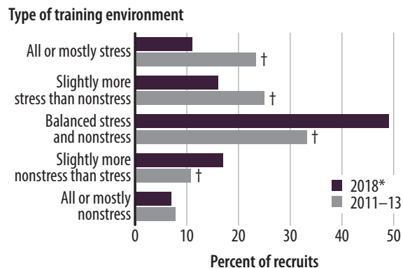
FIGURE 1 Recruits in basic training programs in state and local law enforcement training academies, by type of training environment, 2011–13 and 2018

Note: Academies were asked about the degree to which their curriculum followed a stress model (i.e., military or paramilitary style), a nonstress model (i.e., academic or adult learning), or a combination of both models. See table 6 for estimates and appendix table 7 for standard errors.